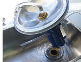
Flush column and packing