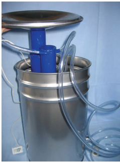
Place into boiler

7. Empty the citric acid solution from the boiler and rinse out the boiler.