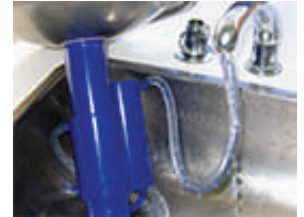
Flush condenser via tube

Note: The packing will need to be replaced periodically as it does wear out and become less efficient. New packing is available from your specialist home brew store.