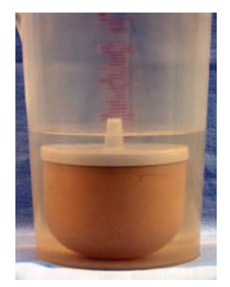
Soaking the Ceramic Cartridge