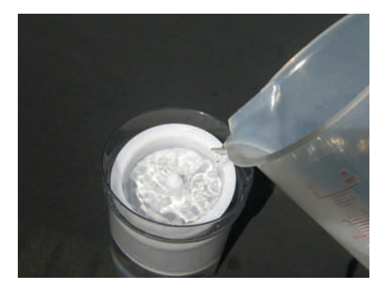
Soaking the Carbon Cartridge

** If the Carbon Cartridge is over tightened, the screw thread may break off. **